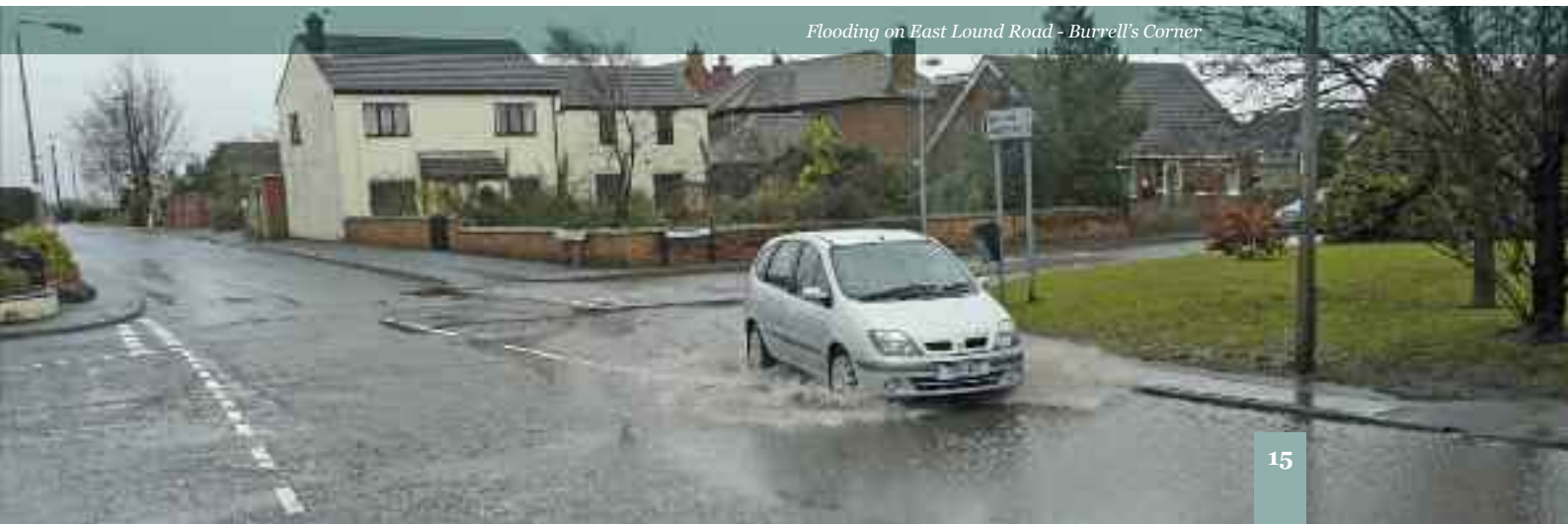
Flooding on East Lound Road - Burrell's Corner

For a full action point summary see the inside back page