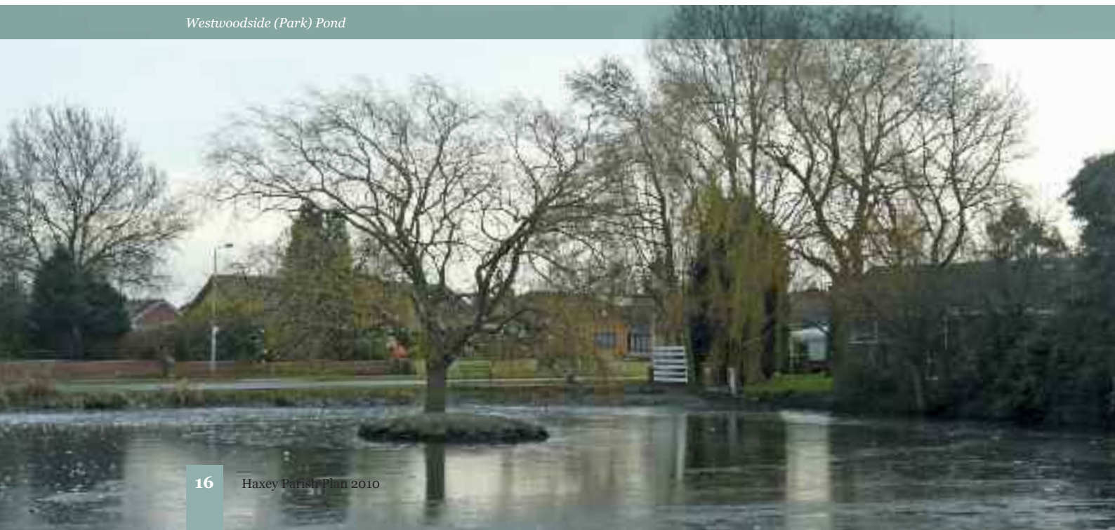
Westwoodside (Park) Pond

For a full action point summary see the inside back page