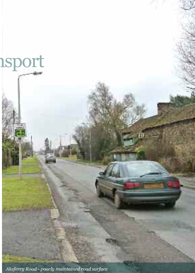
Akeferry Road - poorly maintained road surface

Young mothers complained of narrow overgrown pavements and paths, in particular on the footpath from the A161 to Blackmoor Road. This makes walking with prams/pushchairs and