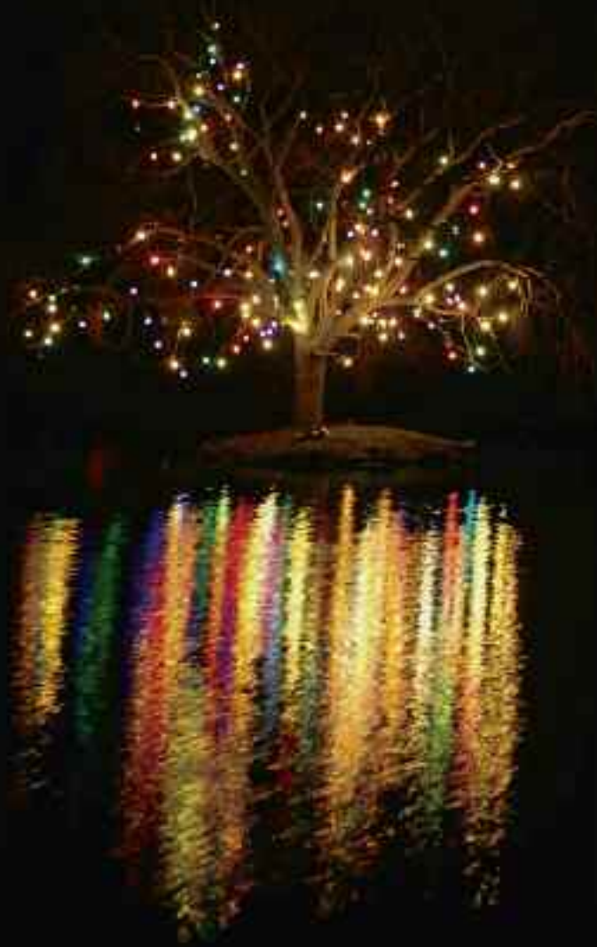
Christmas lights, Westwoodside