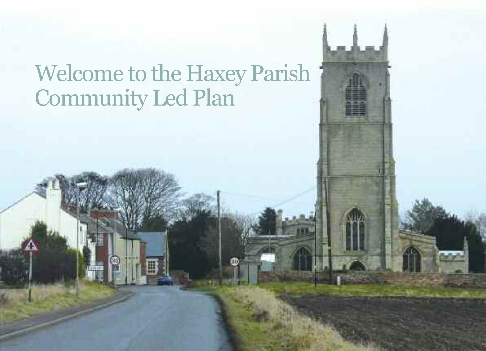
Haxey Parish Church

Many of you may be wondering what prompted the Parish Council to decide to develop a Parish Plan. The main reason was to obtain the views of people in the Parish so that together we can address concerns and highlight how residents would like to see their local area developing over the next 5 to 10 years.