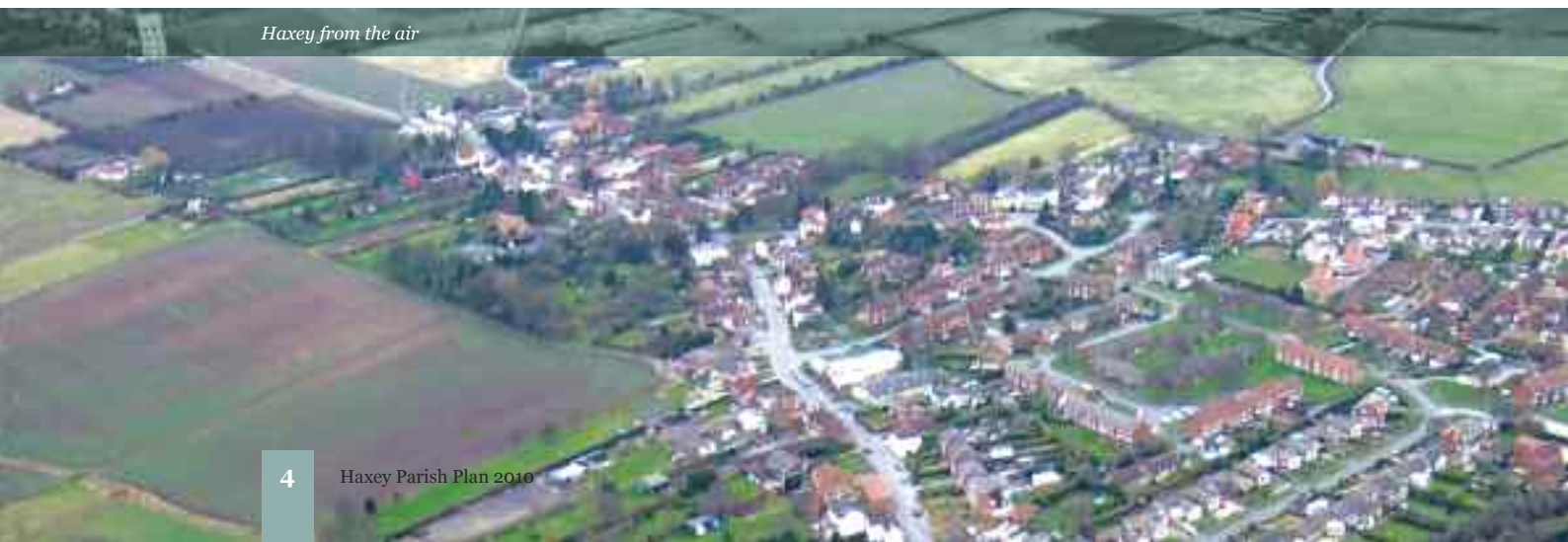
Haxey from the air

The Action Plan at the end of this report needs to be realised and more volunteers are needed to form a Parish Plan Action Group to work with Partners to take forward the points it raises. It is hoped that regular monitoring and review of the Action Plan will take place over the next 5 years.